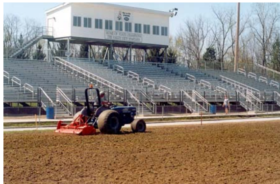
Field renovation is one of the topics covered in the OSU certificate program.

The lectures or presentations for each module is a series of enhanced podcasts that incorporate audio along with numerous photographs on the specific learning experience. For example, the turfgrass certificate consists of enhanced podcasts on cool season and warm season turfgrasses, their establishment and management, and a specific enhanced podcast on over-seeding methods. Each presentation runs for approximately 15 minutes. Each presentation can be watched multiple times. In conjunction with each module is an online glossary and additional supplemental materials.